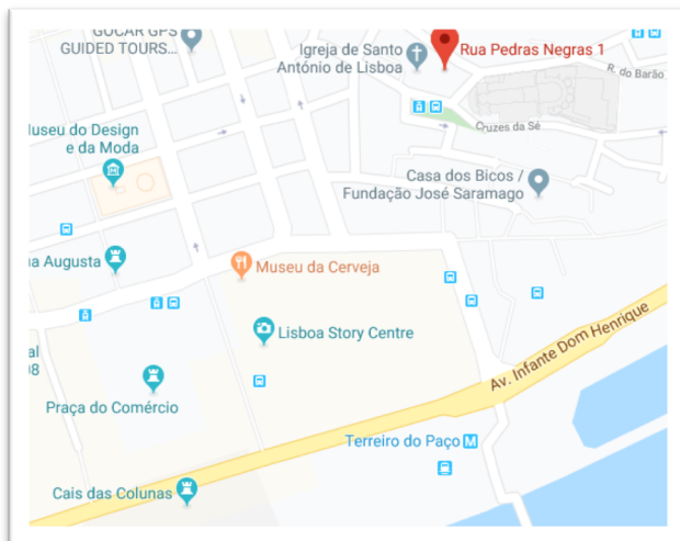
Lisbon – Church of Santo Antonio