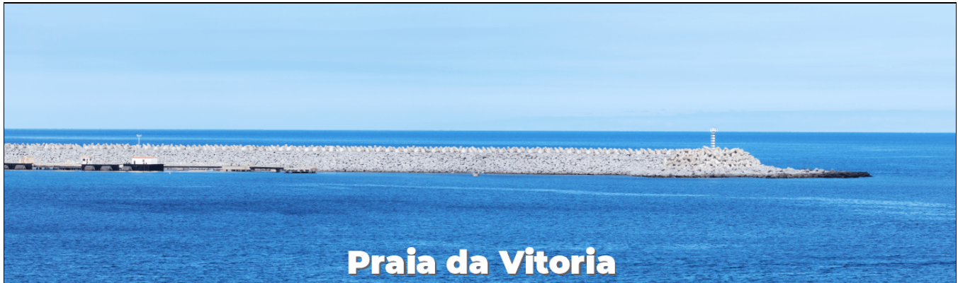
Praia da Vitoria

Overlooking the Atlantic Ocean from a privileged location on the seafront promenade of the sandy Praia da Vitória bay, on the beautiful Terceira Island, Azores, Atlantida Mar Hotel invites you to dive in the Azorean exuberant nature and live unforgettable moments! Get started to discover our magic island with its breathtaking nature and volcanic landscapes! Atlantida Mar Hotel is a very comfortable and awarded hotel, where you can unwind after thrilling island excursions. In addition to the swimming pool, sauna, gym and jacuzzi, we offer 28 units of various types, from standard sea view and mountain view rooms, to spacious, comfortable and wonderfully decorated suites with furnished sea view balconies, in the middle of a very appealing and beautiful, quiet and healthy environment!